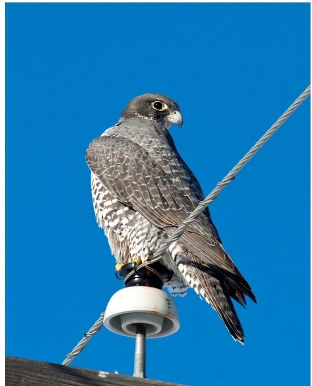
Gyrfalcon on power pole

Last Chance Audubon Society promotes understanding, respect and enjoyment of birds and the natural world through education, habitat protection and environmental advocacy.