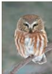
Northern Saw-whet Owl GBBC 2011 Photo Gallery

As you gear up for this year's GBBC, preliminary data coming from Audubon's Christmas Bird Count (CBC) suggest some shifts in where birds are spending their time, perhaps due to the season's relatively mild temperatures. Data suggest that bird species we tend to see in concentrated areas during colder temperatures are now dispersed throughout the landscape, taking advantage of the open marshes and ponds. Consider New York's Central Park where warm temperatures may have played a role in a low bird count this holiday season. Participants tallied 3,286 birds – 3,000 fewer than last year. Citizen scientists like you can help us further monitor some of these trends. So, let's make this year's GBBC bigger and better than ever, and do our part to help the birds.