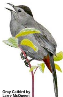
Gray Catbird

Non-Profit Org. US Postage PAID Helena MT 59601 Permit #29