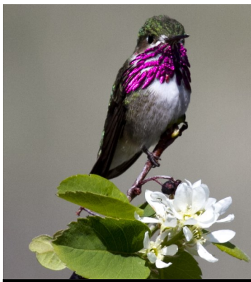
Calliope Hummingbird

Mount Helena City Park — Main access is at the south end of Park Avenue and through Reeder's Village subdivision. Several trails enter the park from the parking area. During the breeding season, Western Meadowlark, Vesper Sparrow, and Mountain Bluebird can be found on the lower north slopes of the park in the grassland areas. In the shrubby draws and brushy slopes Rufous and Calliope Hummingbird, Lazuli Bunting, Green-tailed Towhee, and Chipping Sparrow are usually present. Mountain Chickadee, Red-breasted and White-breasted Nuthatch, Hermit Thrush, Western Tanager, and Yellow-rumped Warbler inhabit the conifer forest areas surrounding the upper half of the mountain. Over 120 species have been reported in total!