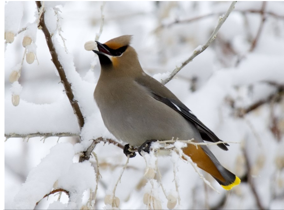
Bohemian Waxwing

But where are they and how can you find them? Well, I have an answer for that too. The Last Chance Audubon Society will be conducting their annual Christmas Bird Count this December. In fact, this year's CBC will be the 69 th count conducted in Helena. The first one was completed in 1954 by a single birder and the count has been done every December since. A few winters ago, the LCAS CBC had an all-time high of 77 participants! This event is a wonderful opportunity to get out there, spend a day with other birders, and count all the birds in the Helena valley. Sounds like fun to me!