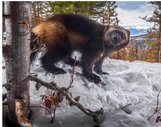
Wolverine