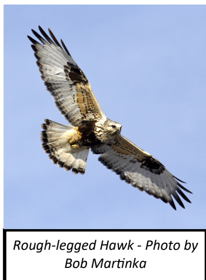
Rough-legged Hawk