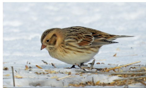
Lapland Longspur