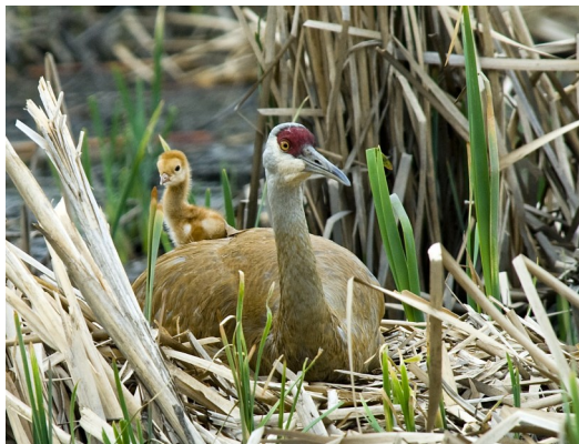
Sandhill Crane with colt

This city-owned stormwater retainment area provides a wild space within the city of Helena. It can be reached by turning north on North Harris St. from Cedar St. Follow N. Harris St. until it deadends at a fence. In the summer, the retainment ponds provide habitat for many waterfowl species including Canada Goose, Cinnamon Teal, and a variety of other ducks.