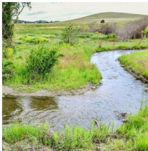
Sevenmile Creek on the west side of Helena

LCAS members have built, installed, and maintained several bluebird trails in the Helena area including at Sevenmile, K-Mart Wetlands, Nature Park, MDT Wetlands, the Regulating Reservoir, and Spring Meadow Lake SP (with help from local Boy Scouts and Montana WILD). For the past two summers I've been monitoring the Sevenmile trail west of town where the birdhouses are being used by both Mountain Bluebirds and Tree Swallows. When I do the surveys I get to see the complete reproduction cycle: nests being constructed, incubating eggs, naked hatchlings begging for food, young feathered birds just before fledging, and then the empty nest again. Some adults are very protective parents and stay on the nest even as I peek inside. At one box I was intimidated by three very determined adult swallows swooping down around my head. That visit, I just kept on moving down the trail.