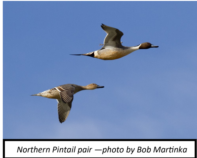
Northern Pintail pair

The area covered includes Alaska to western Ontario and south to the Dakotas and Montana. The species showing a decline in populations included Mallard (-23%), American Widgeon (-28%), Northern Pintail (-43%), and scaup (-29%). The species showing an increase are Gadwall (+25%), Green-winged Teal (+15%), Blue-winged Teal (+2%), Northern Shoveler (+8%), Redhead (+27%), and Canvasback (+5%).