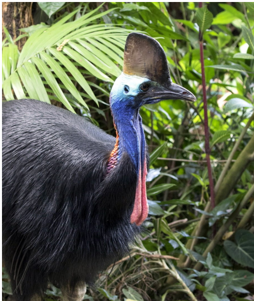
Southern Cassowary - Photo by Bob Martinka

Bob will describe the area and habitats visited including the humid tropical forests of northern Queensland, the Great Barrier Reef, the cool mountain forests around Lamington National Park in southern Queensland, and the coast, mountains, and arid interior of New South Wales. Bob's tour extended all the way down to the rugged coastlines and highlands of Tasmania, home of the Tasmanian Devil! At sunrise the first morning Bob observed many hundreds of Spectacled Flying-Foxes, a fruit-eating bat with a 3-foot wingspan. Marsupial species, including several kinds of kangaroos, were common. The most unique mammal seen was a Duck-billed Platypus, one of only two mammal species that lay eggs! Unique bird species include Southern Cassowary and several Emu.