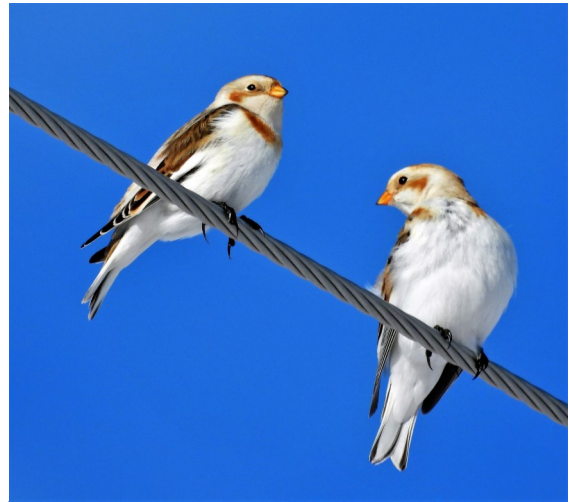
Snow Buntings