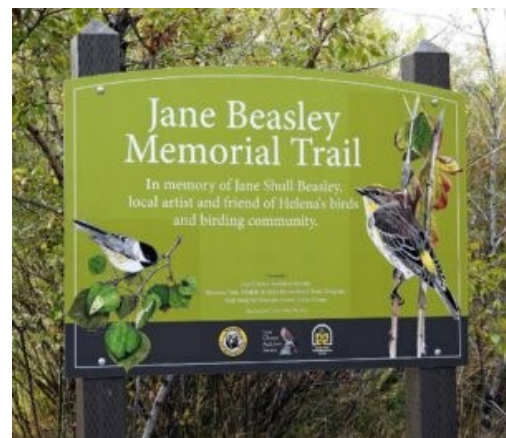
Beasley Trail — Spring Meadow Lake State Park

I’m asking you to consider stepping-up to volunteer your problem-solving skills for LCAS and its mission, “to promote understanding, respect, and enjoyment of birds and the natural world”. Whether it’s behind the scenes – assisting with the newsletter or website, or housing field trip leaders for the upcoming Bird Festival – or more physical – burdock removal, building or maintaining a trail, such as the Beasley Trail at Spring Meadow Lake – or looking for and counting birds – the Christmas Bird Count, or posting sightings on eBird, or leading a field trip, or doing a Winter Raptor Survey – or utilizing your “people skills” as we work with other conservation organizations – such as MT Audubon and Prickly Pear Land Trust – or education - assisting with our high school scholarship fund, making presentations to kids in classrooms, or helping place children’s birding field guides in local school libraries - we can use your skills to assist our Board members.