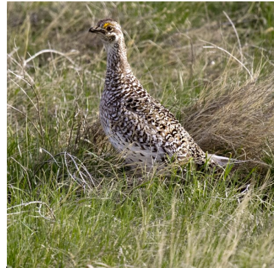
Sharp-tailed Grouse

Benton Lake NWR 922 Bootlegger Trail Great Falls, MT 59404 406-727-7400 BentonLake@fws.gov