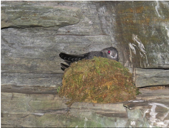
Black Swift

The Black Swift is one the most unusual species that calls Montana home every summer. In this presentation Bo Crees will describe the Black Swift nest-searching and discoveries in the state, survey protocols, and some of the most common challenges dealt with while carrying out swift surveys in remote locations, including high waterfalls. The most recent survey season (summer 2023) will be the focus of this talk, including the challenges of each multi-day backpacking trip to known- or potential- Black Swift nesting areas. He will share the 2023 survey outcomes of 25+ swift nesting sites in Western MT. Plans for the upcoming 2024 season in-