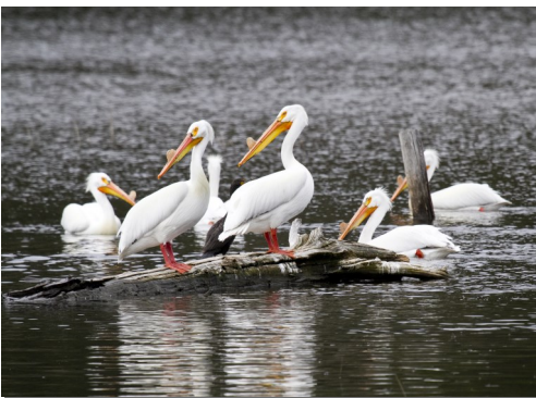
American White Pelican

The 5,000-acre, state-owned area at the south end of Canyon Ferry Lake has a rich diversity of habitats. Dikes have created four 400 to 500-acre ponds which have some 350 small artificial islands for nesting Canada Goose, several species of duck, Double-crested Cormorant, American White Pelican, California and Ring-billed Gull, Caspian Tern, and several grebe species. The river bottom and upland plant communities provide habitat for raptors and songbirds. Nesting species include Osprey, Bullock’s Oriole, Least Flycatcher, Clay-colored and Lark Sparrow, and Western Kingbird. To reach the wildlife management area, take W.S. Hwy 12 toward Townsend. West shore access, including Pond #4, is reached from several gravel roads off U.S. Hwy 12 beginning 4 miles north of Townsend. Access to the east shore is reached by going through Townsend on U.S. Hwy 12 and turning north on Hwy 284. Ponds #1, #2, and #3 are reached by road going west from Hwy 284: Lower Dry Gulch Road goes to Pond #1 (the farthest north); and Lower Ray Creek