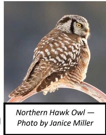
Northern Hawk Owl

A link from eBird discussing the nature of “Sensitive Species” is included below. It defines protocols and practices for observing and reporting these birds. If you are planning to try to locate a known bird that meets the “sensitive species” definition, refer to the eBird Sensitive Species protocol, along with the ABA Birding Code of Ethics , before heading out.