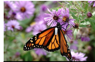
Monarch butterfly.

Motus provides the most precise tracking of birds, insects, and small mammals; better than GPS or satellites can offer. In recent years, scientists have developed tiny tracking devices, such that even a dragonfly can now carry one without detriment to its functionality. Since its inception in 2012, more than 9000 individuals of more than 87 species of birds, bats and insects have been tracked!