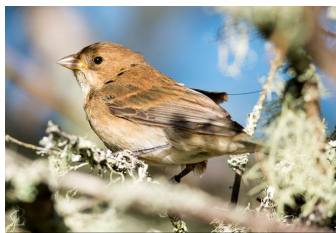
Indigo Bunting.

The “towers”, or Motus receivers, can be customized to meet many different site requirements. Data archived at motus.org is available to anyone who wishes to see it or use it. I strongly recommend taking a half hour to stroll this website. It’s fascinating!