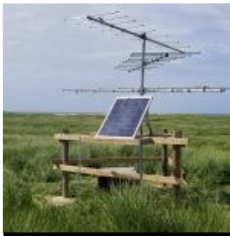
MOTUS station.

We announced this year’s Fall Fundraiser at the October 14 program. We would like to fund a Motus station here in Helena. While the fundraising has begun, the work would likely not take place until Spring or Summer of 2026. It is a worthwhile project. I will try to give you more in-depth information about MOTUS here, so you can judge for yourself.