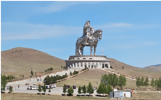
Genghis Khan Equestrian Statue, Ulaanbaatar, Mongolia.