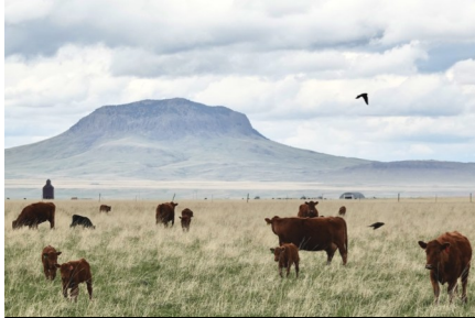
Cattle on the Prairie.