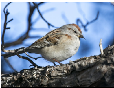
American Tree Sparrow