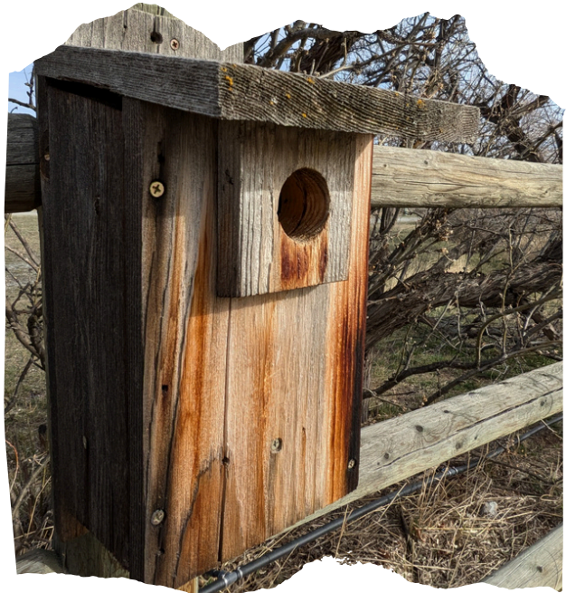
Nest box with added reduction plate to restrict the size of the entrance hole.