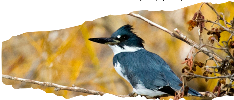
Belted Kingfisher.