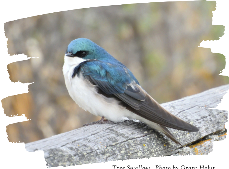
Tree Swallow.

Nest box maintenance: With bluebirds and swallows arriving in the valley, it is time to consider cleaning out and repairing nest boxes on your property. Depending on which bird species you intend to attract, there is ongoing debate as to whether nest boxes should be cleaned. After all, the natural cavities used for nesting are not cleaned by humans.