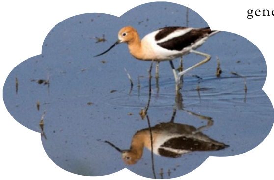
American Avocet.