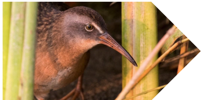
Virginia Rail.