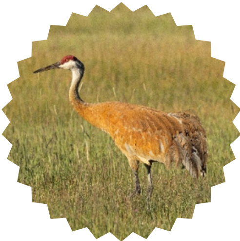
Sandhill Crane.