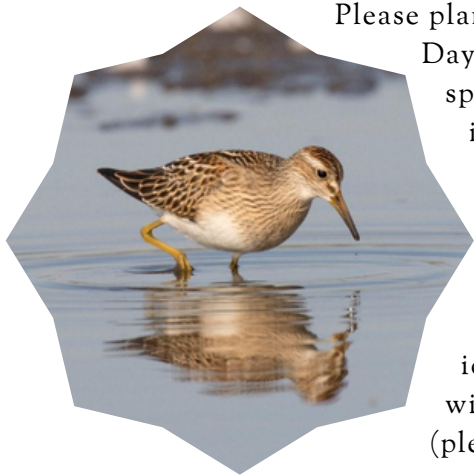
Pectoral Sandpiper.

Please plan to join Last Chance Audubon in support of World Shorebird Day! This field trip will focus on surveying shorebirds and other species at Canyon Ferry WMA. Likely shorebirds we will find include: Pectoral Sandpiper, Semi-palmated Sandpiper, both yellowlegs species, Least Sandpiper and possibly a few others.