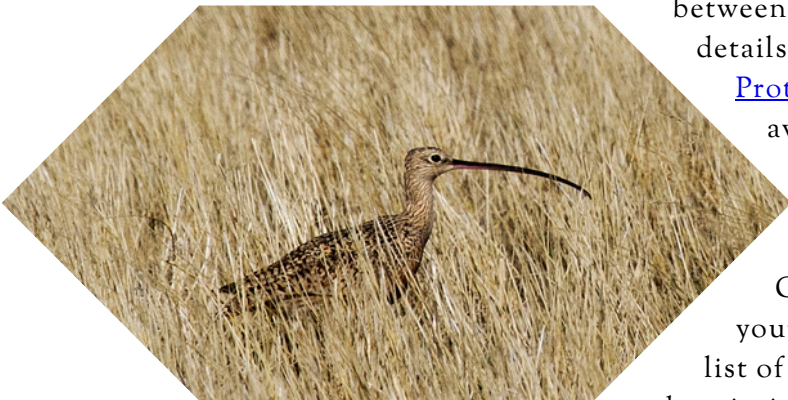
Long-billed Curlew.

Long-billed Curlew surveyors: If you prefer to do your citizen science on-the-road, there are still routes available to adopt for the inaugural year of LCAS hosting Long-billed Curlew surveys. We are looking for volunteers willing to drive established survey routes at least once, although you can survey more often if you like. Each survey takes approximately two hours and must be completed